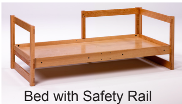
Bed with Safety Rail

One of each of these items is provided for each student.