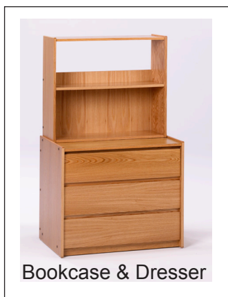
Bookcase & Dresser