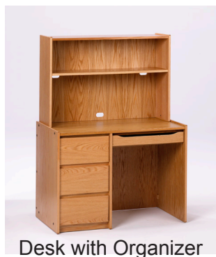
Desk with Organizer